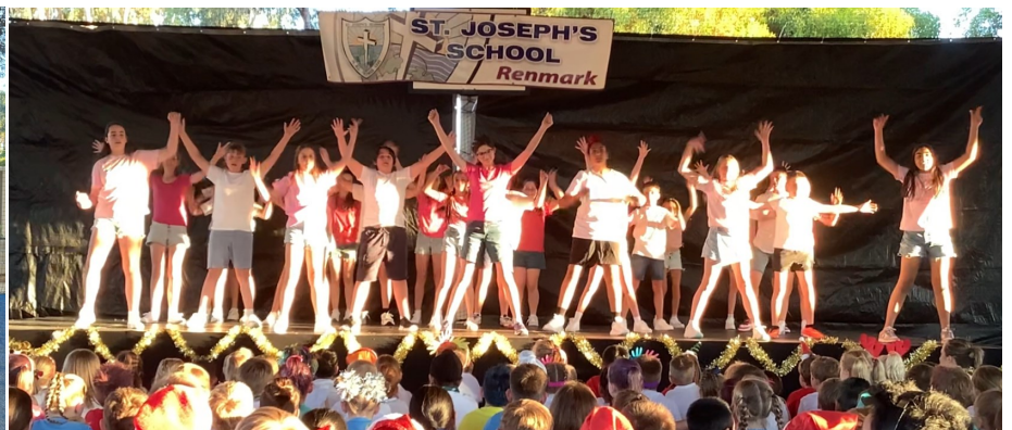
Year 6 final performance