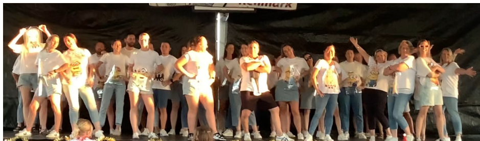
Staff performing at our Concert.

The staff have worked very hard producing Semester Two reports which were distributed today. The SEQTA format includes content from the Australian Curriculum. It is essential to understand that reporting and grade interpretations have changed significantly over the years and it is imperative that we have a clear and common understanding when reviewing reports. We have communicated the grading system that recognises each individual achievement and where they are at with their learning journey. The most significant aspect of the report is the teachers comment and the attitude achievement. Parents should acknowledge and focus on the effort as a highlight and not only the overall grade.